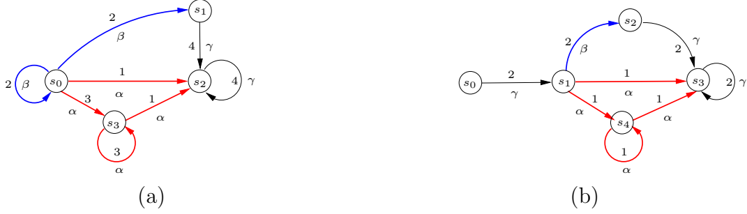
Fig. 1. Uniform CTMDPs where (a) SMD-schedulers are less powerful, and (b) where THD schedulers are more powerful than HD-schedulers.

other types of events, however, such correspondence can not always be established. That is, in general, randomized schedulers can be better than deterministic schedulers. This observation was made by Beutler and Ross [10] who showed that the maximum of time-average rewards under randomized schedulers might be larger than under deterministic schedulers. In fact, the crux of the proof of Theorem 7 is the observation that the values \Pr_D(s, \overset{\leq t}{\rightsquigarrow} B) converge to \Pr_D(s, \overset{\leq t}{\rightsquigarrow} B) , where the subscript \leq n denotes that B has to be reached within at most n steps. This property is not guaranteed for other types of events.